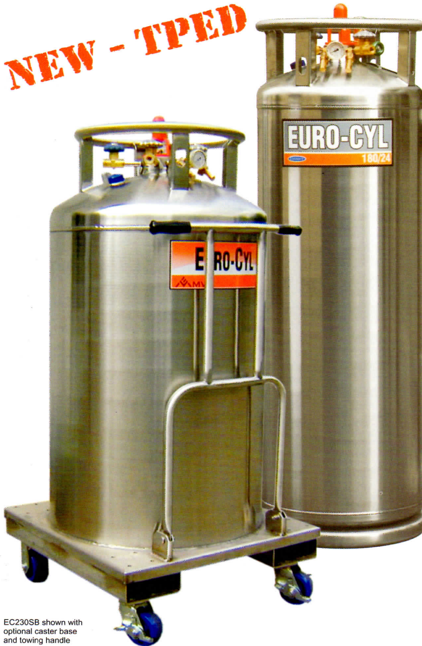
EC230SB shown with optional castor base and towing handle